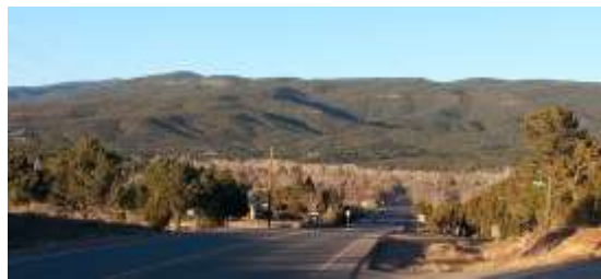
Historical Village of Pecos

The Fun 5k Run/Walk and 10k Run will begin in the front of the Pecos High School