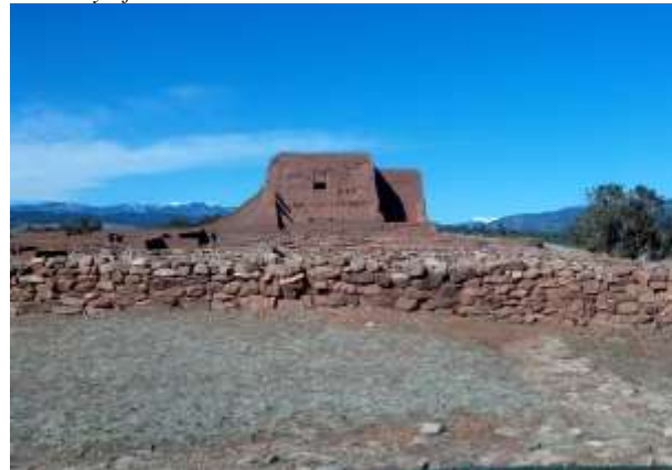
Indian Pueblo and Church within the Pecos National Historical Park/ 10K turnaround.